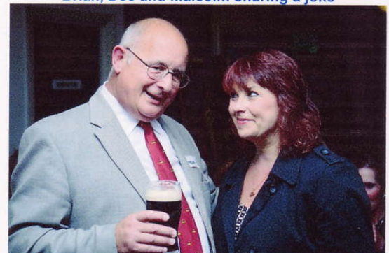
The old "I can get you into pictures" routine. Unfortunately he meant the FOTOPC newsletter