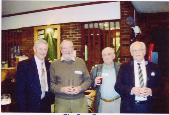
The Four Tops