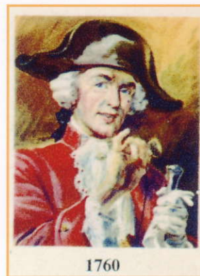
1760 The old Guv'nor, God Bless him !