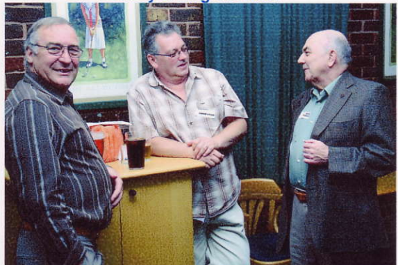
WED quick repair to stop the bar-counter moving